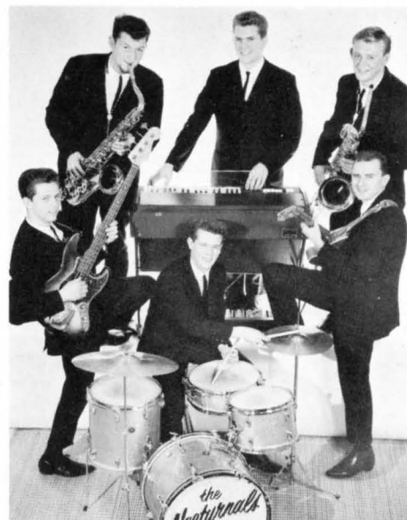
The Nocturnals from Vancouver have a hit going for them "Because You're Gone" (Regency).