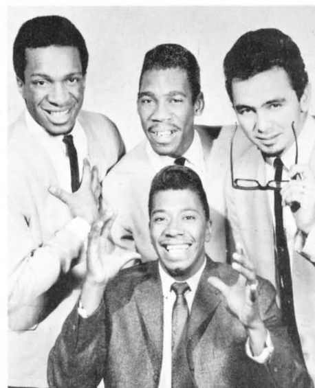
One of the most popular blues groups on the west coast, Little Daddie & The Bachelors are in the market for a recording session.