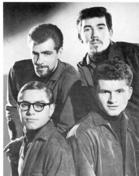
The Chessmen, Vancouver based foursome currently riding well with "The Way You Fell".